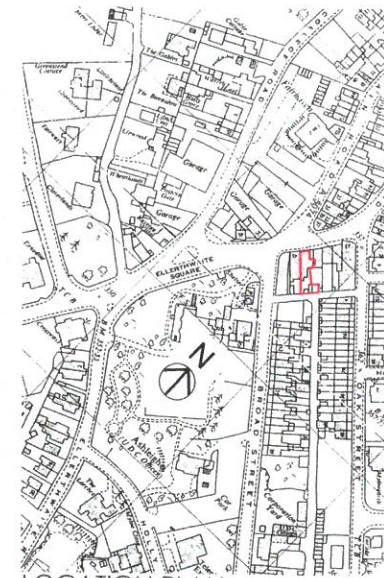
LOCATION PLAN 1:2500@A2